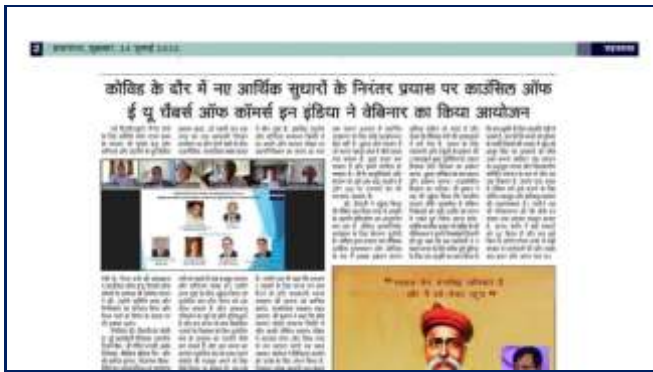
Coverage of Sustained Push to Reforms to harness the emerging opportunities in the Post Covid Era