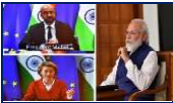
Joint Statement of the 15th India-EU Summit (July 15, 2020)