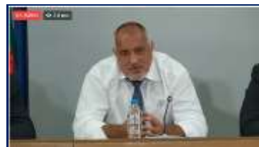
Bulgarian Government is Allocating BGN 1 Billion for Social and Economic Measures in the Fight Against