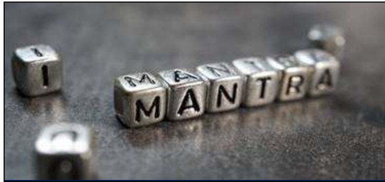
“6 Mantras for Business Excellence for SMEs”