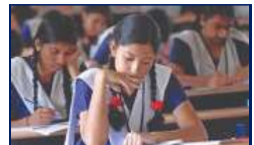
NEP 2020: Foreign universities now allowed to set up campuses in India