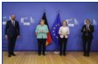
Covid-19: 10 things the EU is doing to ensure economic recovery