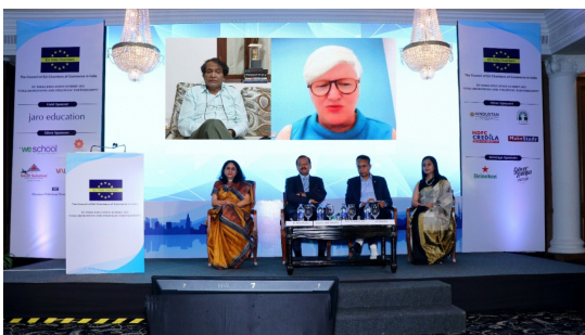
EU India Education Summit 2022 “Collaborations and Strategic Partnerships”