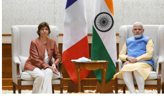
First Official Visit to India of H. E. Ms. Catherine Colonna