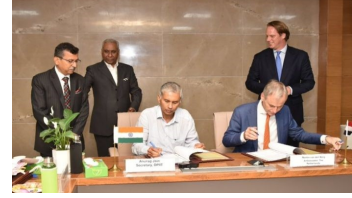
India, Netherlands formalize bilateral Fast-Track Mechanism between both countries