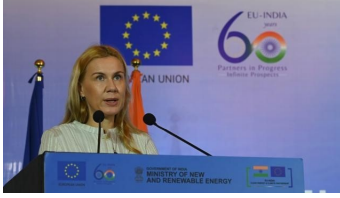
EU Commissioner Kadri Simson concludes her two-day visit to India