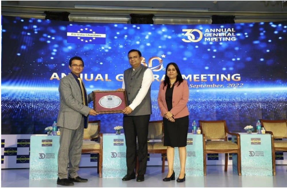
30th Annual General Meeting