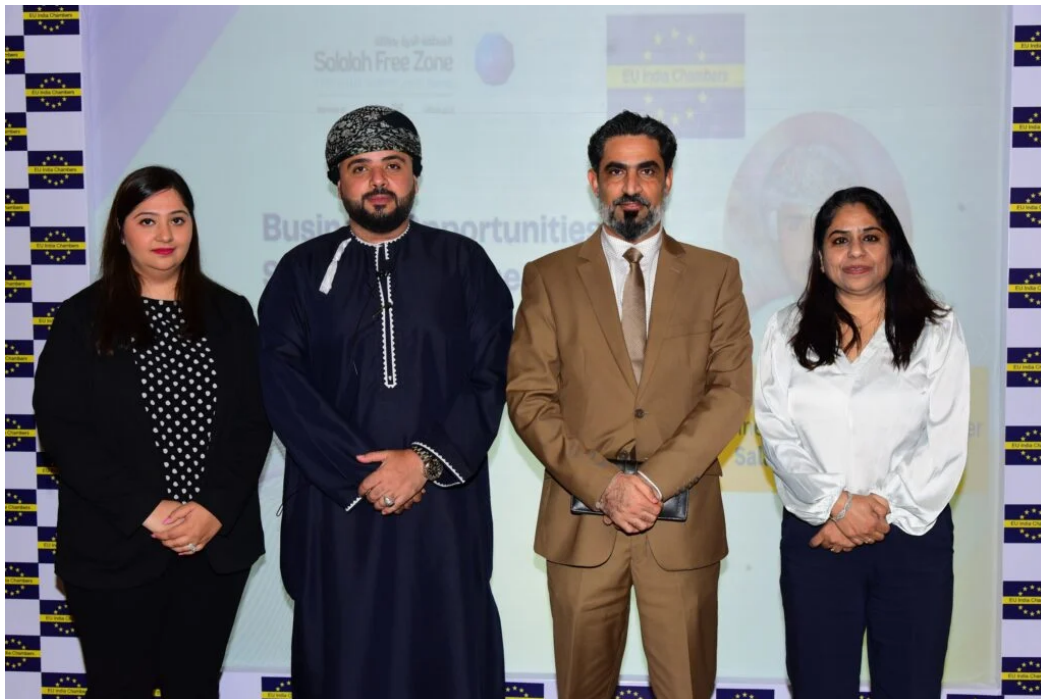
Business Opportunities in Salalah Free Zone- Oman