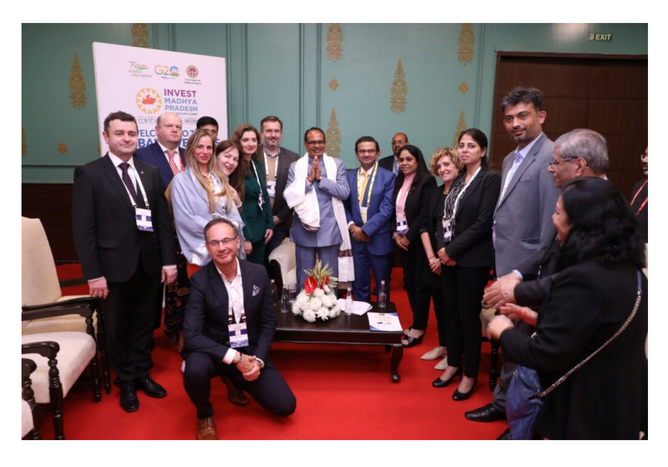
The Council of EU Chambers of