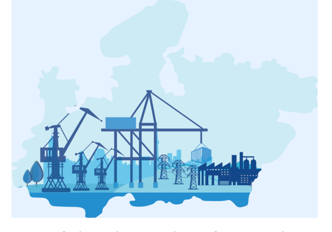
Panel Discussion on Union Budget 2023 & its Implications